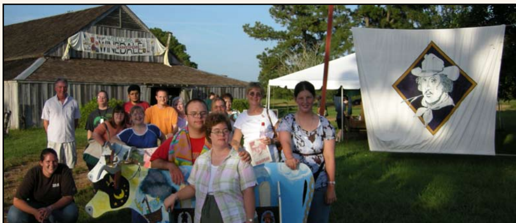
Shakespeare at Winedale is a favorite summer outing for the Down Home crew. We bring a picnic dinner, enjoyed under the towering oaks, and then laugh and cry at a great production by University of Texas students. This year it was Two Gentlemen of Verona.