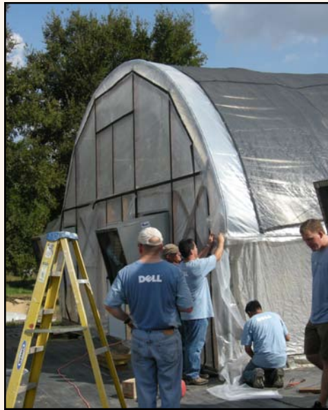
(Above) Dell volunteers putting new skin on the Llano greenhouses. Two layers of plastic are installed and then a pump blows air between the layers, inflating a space that helps keep the houses cooler in the summer and warmer in winter.