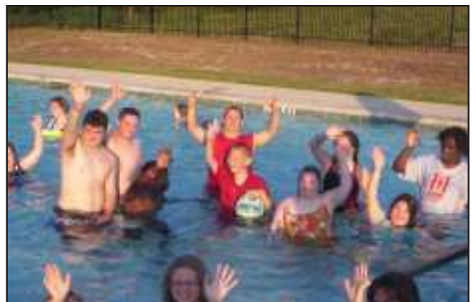
The pool is a big hit this summer, although bathrooms and Fitness Room aren’t functional yet. Ranch Campers and residents all love having a cool pool to enjoy while temperatures climb. We’ll be using the Swim Center on September 5 for our 1st Annual Swim Fest.

Thanks again to the Dodge Jones Foundation for The Perfect Challenge and the beautiful Enterprise Center.