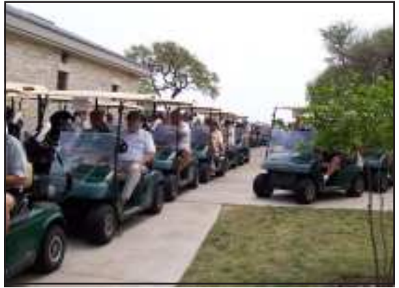
Golfers await the start of the 2nd annual Ranch Roundup Charity Golf Tournament held at Avery Ranch Golf Club. Where should we play next year? Call us with your idea.

Everyone came away with treasures bearing the band members' autographs: T-shirts, drumsticks, CDs, etc. (And the old folks danced the most, 'cause it was our music!)