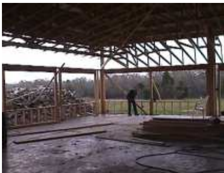
View of the Pavilion dining room after the old cinderblock wall was demolished and the new trusses installed. The expansion doubles the size of the dining room.