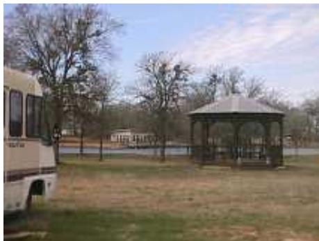
View of the Gazebo, pond and Dock House from one of the seven RV sites. We're adding a shower and washer/dryer to the Dock House to make it more amenable to volunteers with RVs.

Call if you'd like more information about volunteer opportunities during your RV travels 888-926-2253.