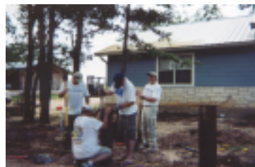
Dell Community Service Day