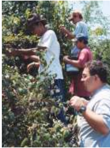
Down Home Ranchers in the pecan bottoms picking wild Mustang grapes. Later we steamed them, getting five gallons of juice to make our famous (someday) Wild Mustang Grape Jelly.

This is our mission. Now that we see it happening it brings great joy to us. You too share in this great venture. Enjoy it with us.