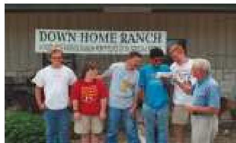
Ranchers look on at a $620,000 check from the Dodge Jones Foundation. These funds will be used to build the Enterprise Center, two Rancher homes, a staff cottage, swimming pool and Fitness Center

Perfect Challenge funds are restricted to capital expenditures, they are not for day-to-day operating costs. Our operating budget is going to rise with each new structure so we will be redoubling our efforts in asking all who love Down Home Ranch to rally to support our mission of serving those with special needs.