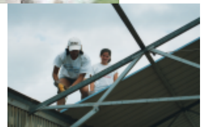
Texas A&M chapter of the National Society of Collegiate Scholars