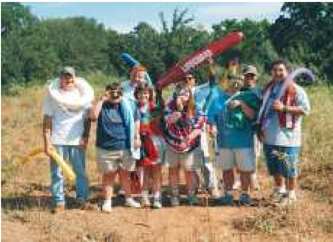
Down Home Ranchers getting ready for ground-breaking for a long-awaited event--the building of the DHR Swim Center. Right now it's a field of weeds but soon will be transformed into an L-shaped pool, bath-house, patio and Fitness Center--with eight exercise stations, including stationary bikes, weights and more.