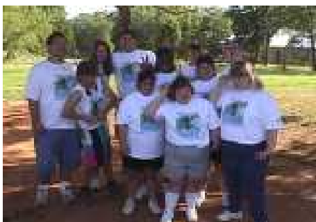
Ranch Campers from Session V strike a silly pose for their group photo.

June 12-17 Camp Session I June 19-24 Camp Session II June 26-July 1 Camp Session III July 10-15 Camp Session IV July 17-22 Camp Session V July 24-29 Camp Session VI