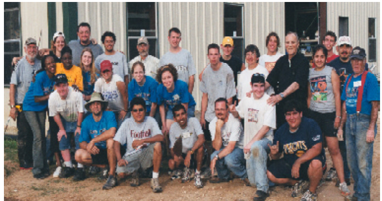
DHR staff, volunteers and College Mission Week students from Texas Woman's University, Sam Houston State, UT Austin, Trinity University, Navarro College, Mary Hardin Baylor and Texas A&M.

Not every college student in Texas headed for the beach over spring break this year. For the second year in a row, a number of them spent Spring Break helping out at "College Mission Week" at Down Home Ranch. Thirty students from seven different universities worked side by side with the residents in the berry patches, the greenhouse, community gardens and tree farm. They baked cookies and helped with craft projects. They poured concrete footings for the greenhouse expansion and put on a pizza party and dance for Ranchers and local special needs kids. They worked hard and played hard resulting in an incredible Spring Break for Down Home Ranch. A great bunch and a great week. We miss them all. Ya' ll come again!