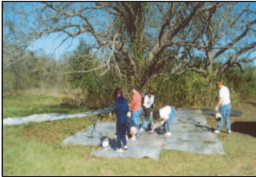
A warm November afternoon and Ranchers are down picking pecans for Christmas.

Are you receiving our e-newsletter? Stay current on the happenings at Down Home Ranch by signing up. Send an e-mail to newsletter@downhomeranch.org .