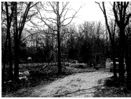
The road into The Village is a rough right now, but it will be a beautiful drive one day.