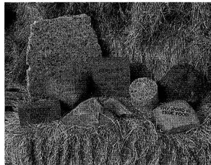
A variety of bricks and stones will be engraved and installed at the Ranch—a beautiful and permanent way to honor or remember a friend, loved-one or yourself!

We're working to be more and more self-supporting—although charitable contributions will always be vital to the Ranch.