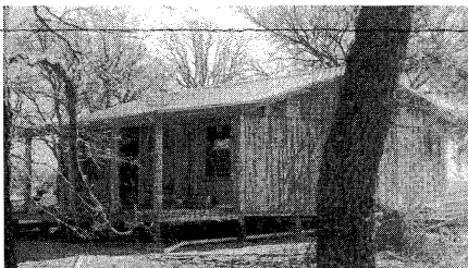
Cedar volunteer cabin under construction.