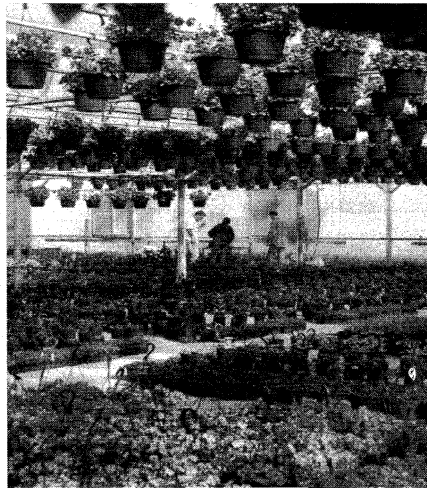
Gorgeous spring flowers fill the greenhouses. View this picture (and the entire newsletter) in color at downhomeranch.com .

But we depend upon a lot of folks giving what they can to sustain us. So don't ever think that your small donation doesn't count. It's the lifeblood of the organization. If you are among this group, thank you. And if you aren't, we invite you to join us.