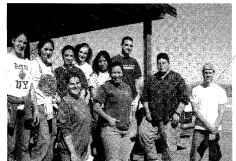
Volunteers from the Texas A&M University Catholic Student Center spent a Saturday doing a variety of labor on the hoop houses, getting us ready for 50,000 seedling trees. This was the third time TAMUCSC students have done volunteer work at the Ranch. Thanks!

Down Home Ranch 20250 FM 619 Elgin, Texas 78621 (512) 856-0128 or (888) 926-2253 Fax: (512) 856-0256 e-mail: dhr@flash.net www.downhomeranch.com