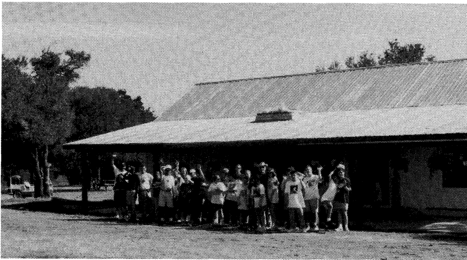
Ranch Campers and volunteers wave in front of the Camp Center. The building, donated by Catholic Charities—a gift from Jerry and Stepanie Gregoire—was thoroughly initiated over the three weeks of camp. Over 70 campers benefited from the Center, some of whom “camped” in one of three bedrooms. The back deck, a contribution of Mike McCoy, McCoy’s Building Supplies was an indispensable gift—the site of all meals, activities, evening vespers and... a place to sit and talk.