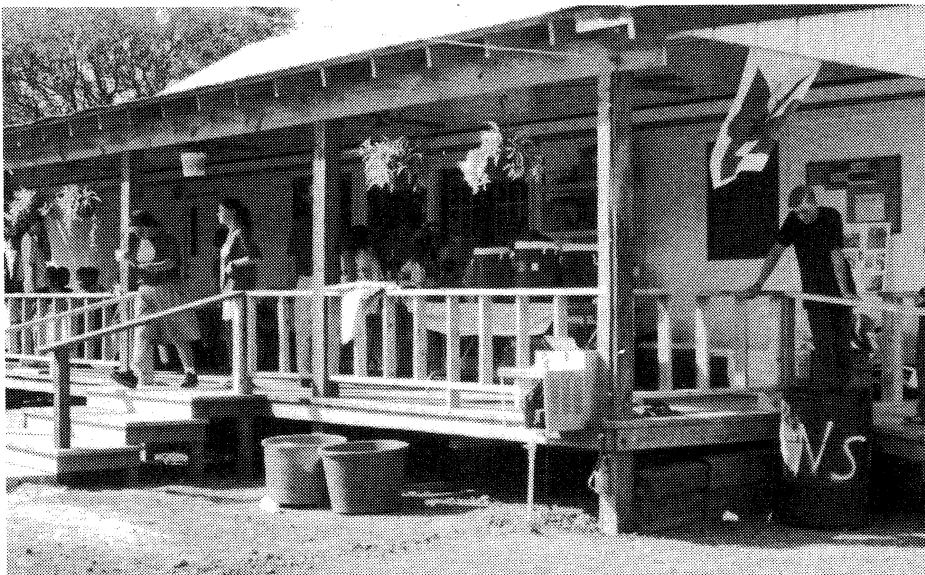
The deck at Camp Center. McCoy's Building Supplies donated most of the material for the deck, which was a beehive of activity during Ranch Camp. Workers labored until after 9:00 on the Saturday before camp to make sure it was ready for Ranch Campers.